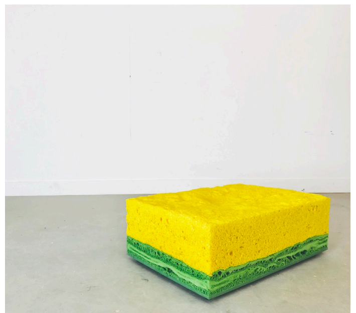
Atelier Nick Boers (NLD)